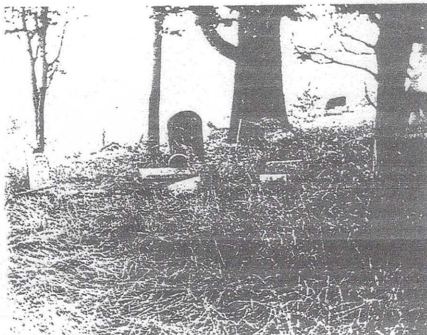
As found on 13 Aug 1989

Fields Family Cemetery Harrison County Hicky Farn on Ky 32, Between Connerville and Davis. Ky.